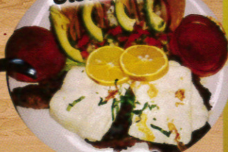
Mar y Tierra